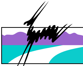
Stevens Creek Striders