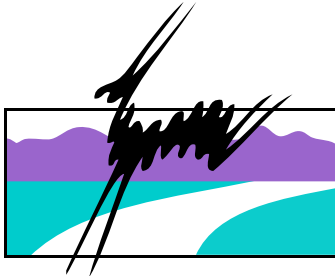
Stevens Creek Striders

To prepare and organize the race we expect costs for the following