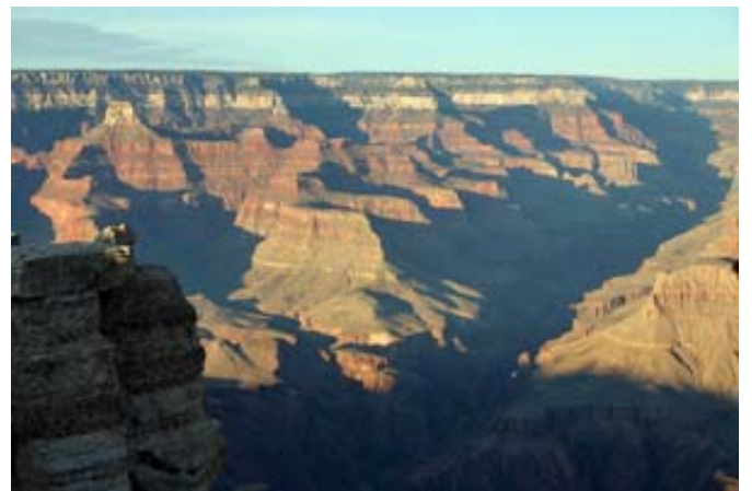
Grand Canyon at Sunset from South Rim